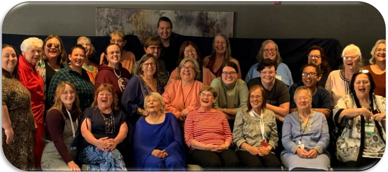
Electra Province Conclave October 2023