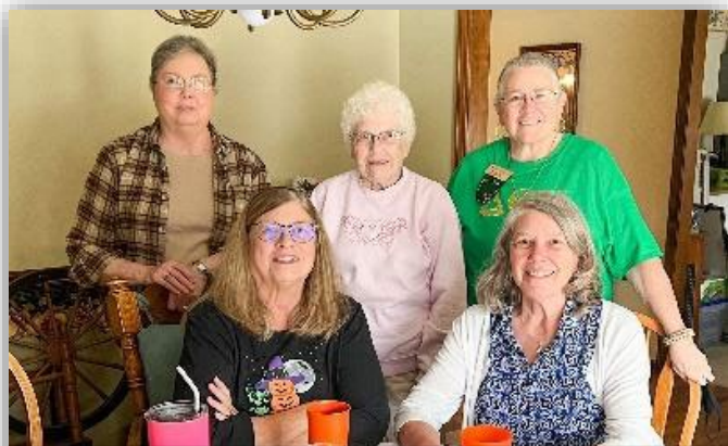
Social/Luncheon discussing Killers of the Flower Moon